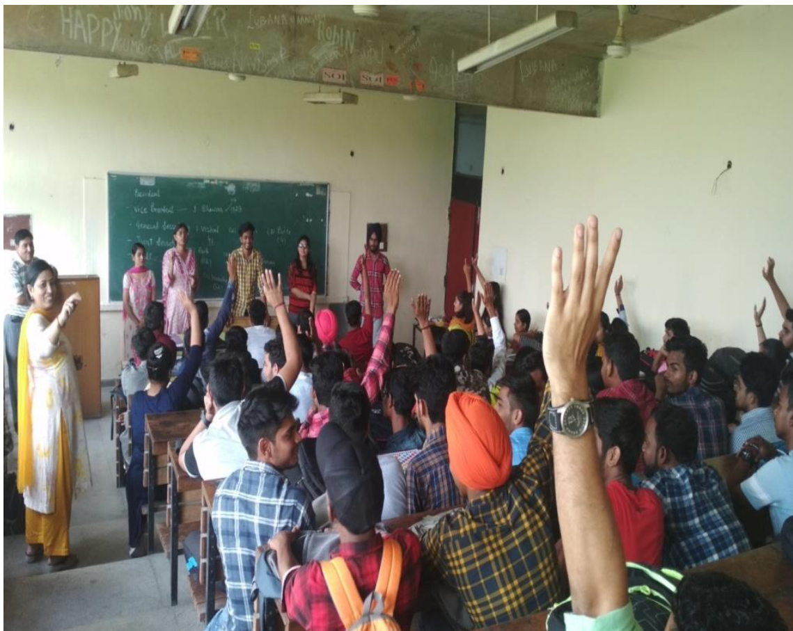
(Students' voting for Office Bearers of the Geographical Society (2018-19))