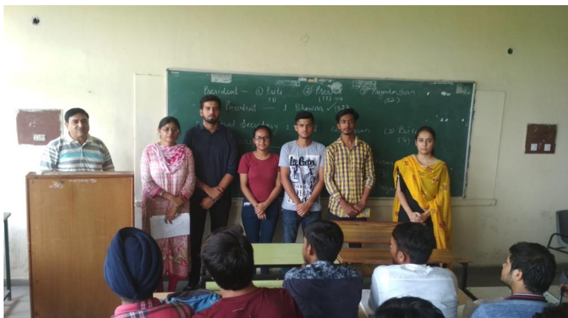
(Elected candidates of Geographical Society 2018-2019)