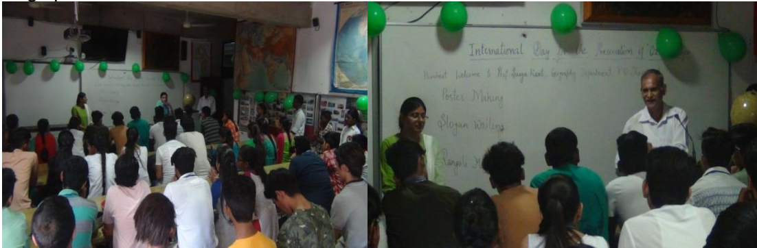
[ A brief talk on Ozone by the Head of the department][ Chief Guest addressing the students]

The judges appreciated the efforts of the students and encouraged all of them to continue with the winning spree in future as well.