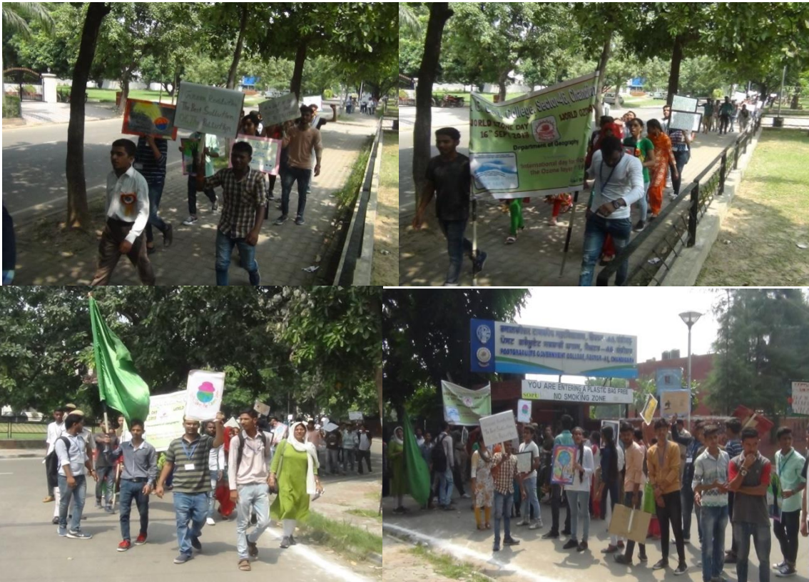
[Rally covered the market & residential areas of Sectors 46 and 47]