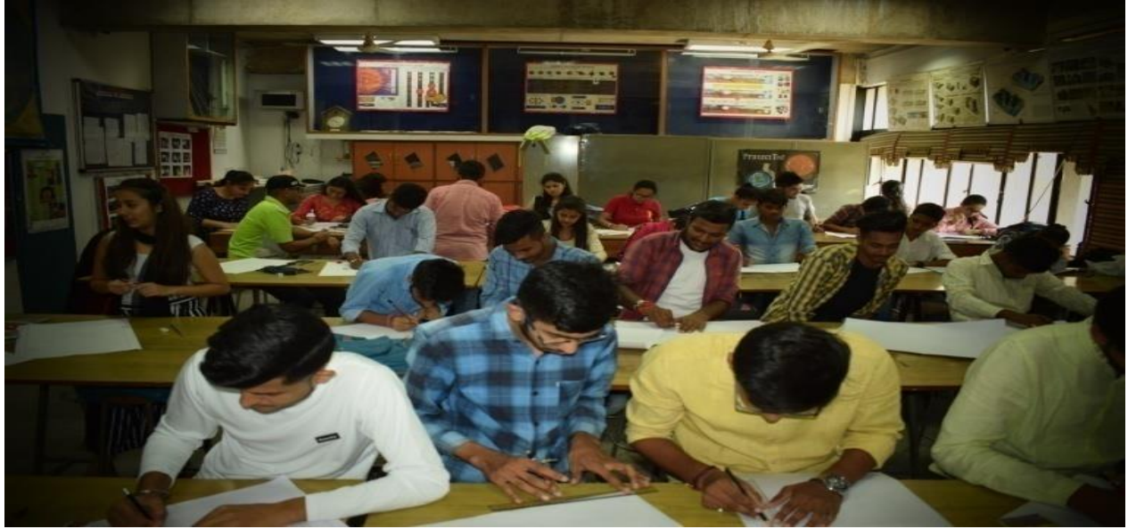
{ Intense Competition Scenario in Lab 104 }