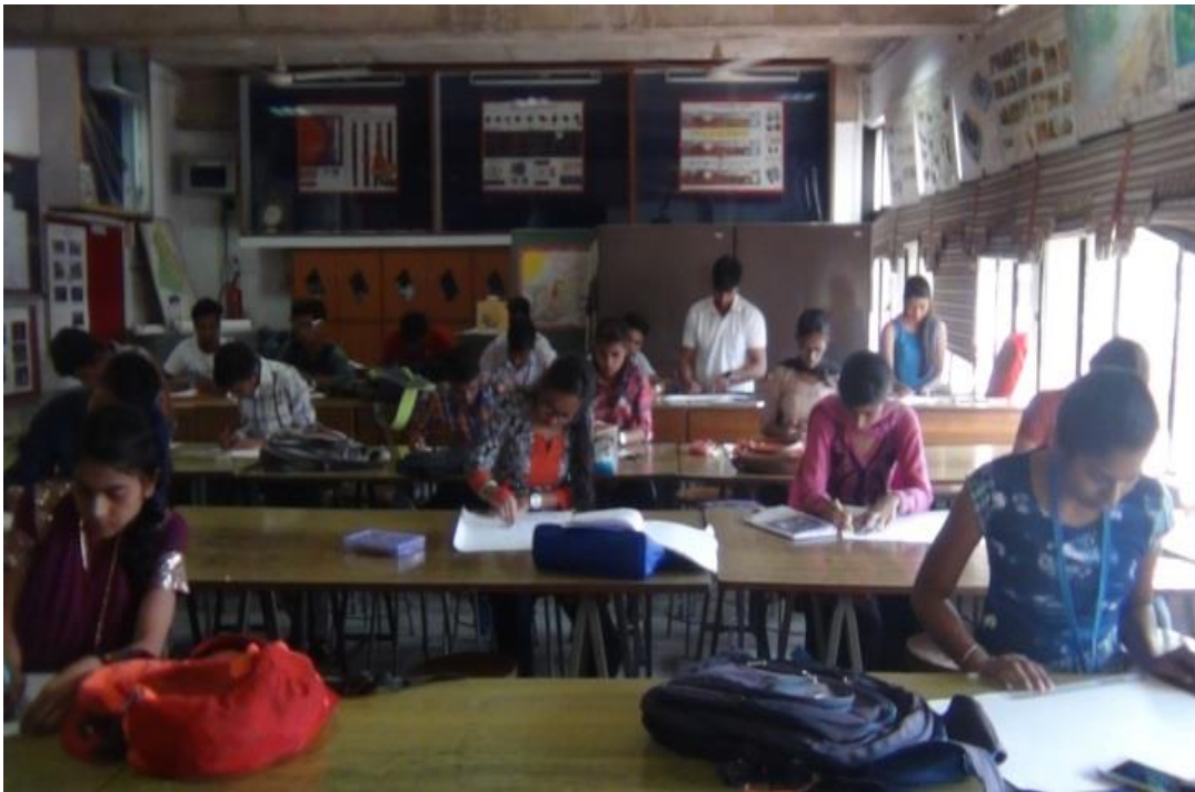
[An Intense Competition Scenario in Lab 104]