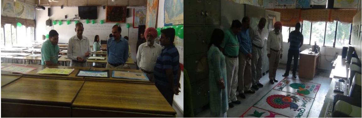
[A Discussion on Posters and Rangoli Judgment]

The judges appreciated the efforts of the students and encouraged all of them to continue with the winning spree in future as well.