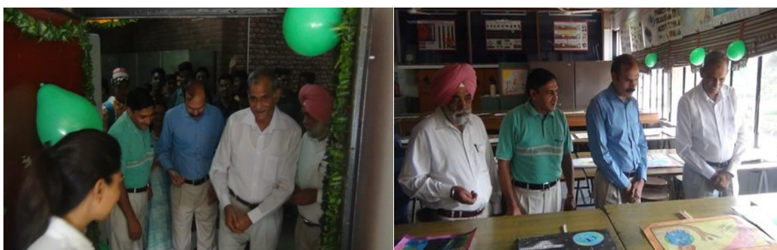
[Inauguration of Function by Chief Guest][Judgment Moments of Slogans Writing Contest]