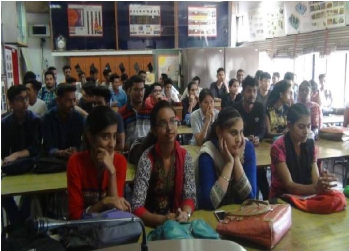
[Students gathering in the electoral process of electing the Geographical Society (2017-18)]

The Geographical Society was constituted on 2 nd September, 2017 Room No 104 at 12:15 p.m to encourage student's participation in the functioning of the Geography department whereby mutual cooperation from the students will voluntarily be elicited to assist the department in organizing a variety of subject related activities in both on and off campus.