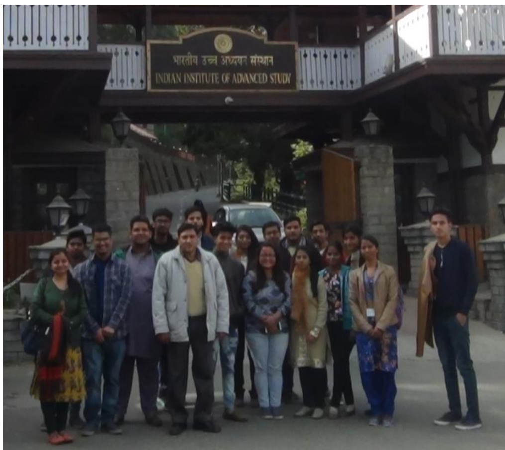
Entrance Gate of the Indian Institute of Advanced Study in Shimla

This trip had definitely helped our students to enhance their observational and team supporting skills as they were discussing their experiences gained through this trip all the way back to Chandigarh. Since lots of places of academic interest were remained untouched by this short journey, these will be covered in future.