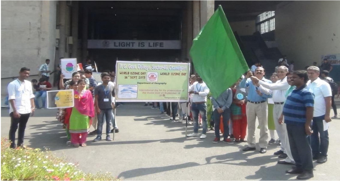
[Fagging of Rally to preserve Ozone Gas]