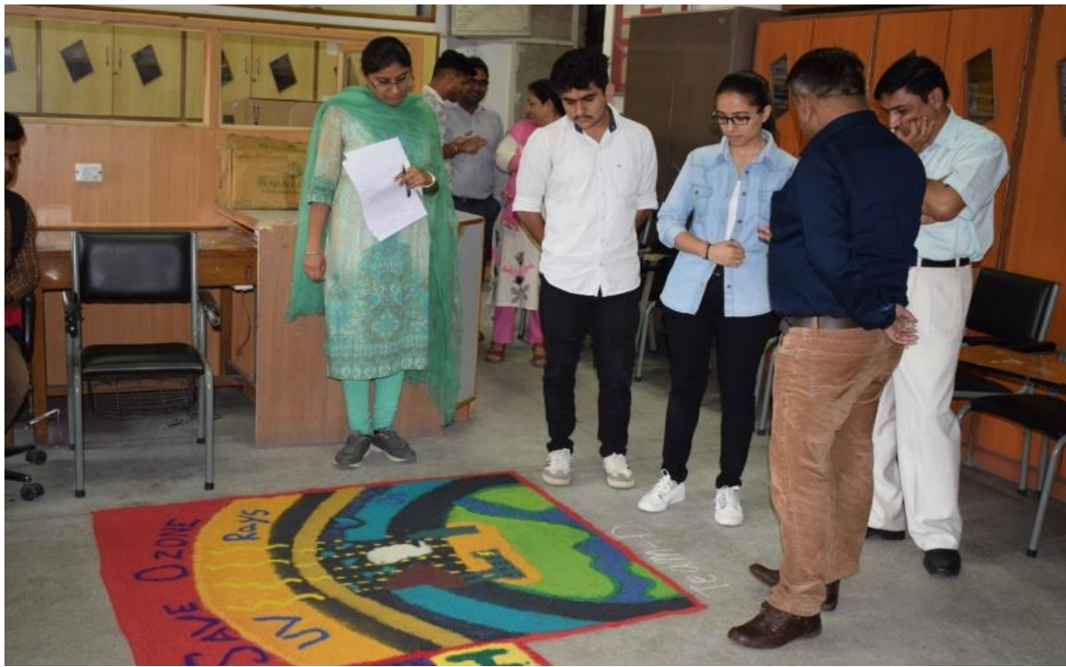
[A Discussion on Rangoli Judgment]