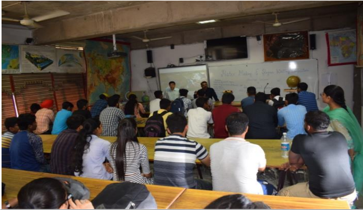
[Chief Guest addressing the students]