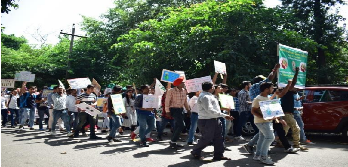
(Rally covered the market & residential areas of Sectors 46 and 47)